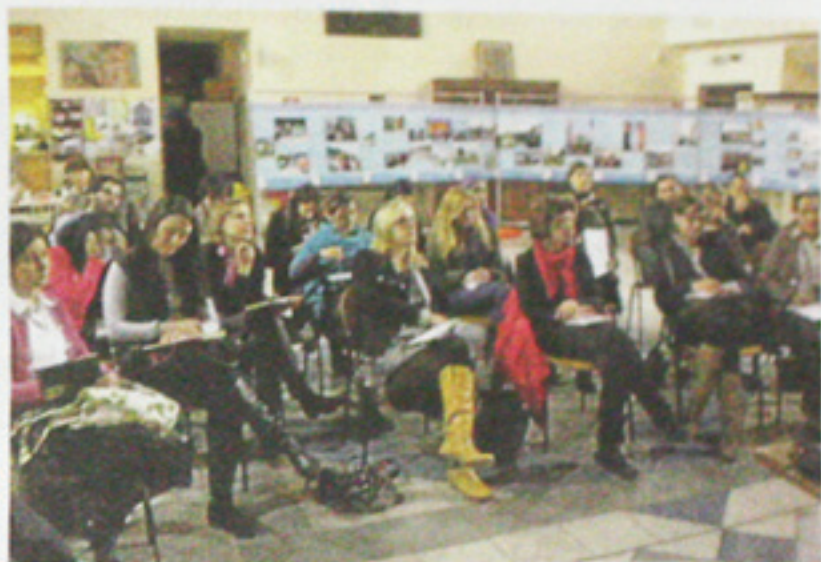
A Brescia i ragazzi dello University College of London

Ieri sera, partecipando ad una cena preparata dalle donne rifugiate nella nostra città, sono entrati in contatto con la multiculturalità bresciana, mentre oggi comincerà il vero lavoro: dopo un'introduzione storica sugli ultimi trent'anni di Brescia e sulle sue trasformazioni, i ragazzi si confronteranno con le realtà più problematiche della città, studiando le difficoltà che i rifugiati poli-